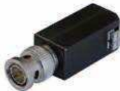
DS-1H18 Video Balun